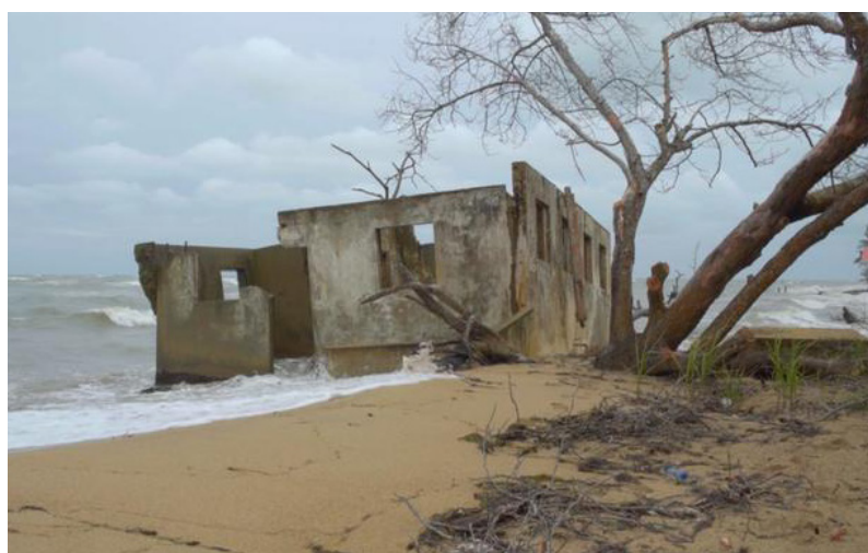
Belize - Monkey River