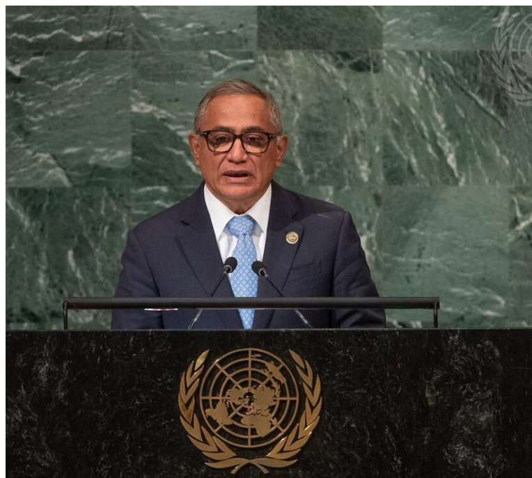
Prime Minister of Belize at UNGA